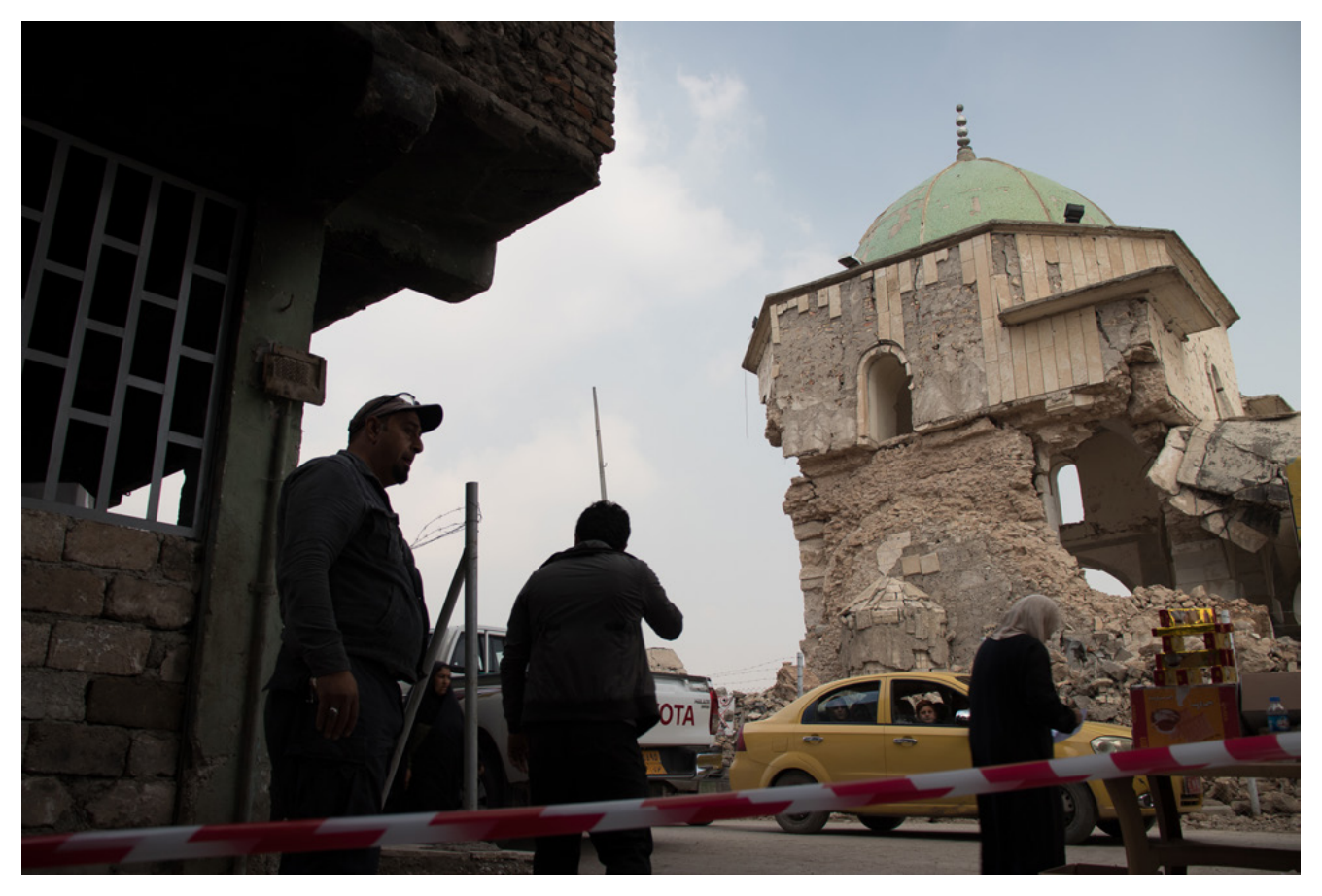
Total destruction in indiscriminate counter-terrorism offensives In Iraq, Mosul's old town experienced intense shelling, aerial bombing and attacks with improvised explosive devices (IED) during the conflict to retake the city from the Islamic State group in 2016/17.

Instead, the burden of proof is shifted to humanitarian workers. This demonstrates how counter-terrorism contexts are dominated by uncompromising narratives that polarise issues and eradicate nuance, often through the silencing of credible voices, such as those of health workers.