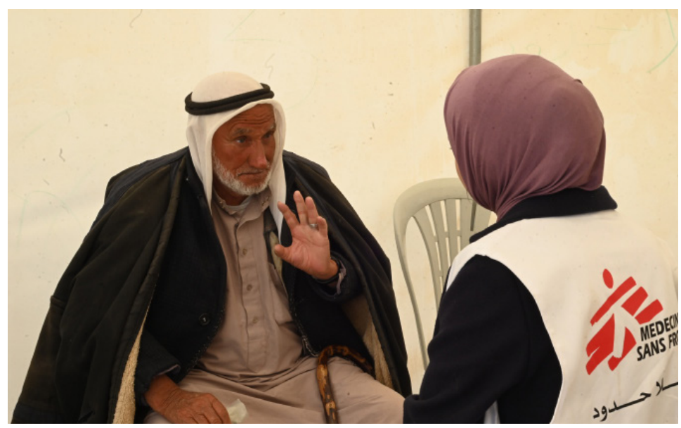
An MSF staff member speaks to a 70-year-old beneficiary from Al-Majaz community in Masafer Yatta, West Bank, Occupied Palestinian Territories.

The first month after 7 October was especially violent, which was reflected in the increase in mental health support needed. Up to 149 Palestinians who had experienced violence by Israeli soldiers and/or settlers required psychological first aid from MSF—compared to 78 during the previous month, a 91% increase. As of 7 March 2024, MSF's mental health team in Hebron has provided counselling and psychotherapy sessions to 125 new survivors of violence by Israeli forces and/or settlers since 7 October, including 54 women and 40 children, some as young as three, four, and five years old. An additional 321 Palestinians (including 29 children and 158 women) who were affected by violence by Israeli forces and/or settlers received psychological first aid from MSF. Of those, 292 were affected by violence by the Israeli forces (91%), 10 by Israeli settlers (3%), and 19 by Israeli forces and settlers (6%). The vast majority, 226 patients, exhibited symptoms of anxiety after experiencing a home incursion.