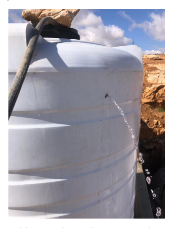
Water tanks with bullet holes, caused by settlers shooting at homes, herd, and water tanks, according to the community.

As reflected in the data on the escalating violence in the West bank (Table 1) and supported by testimonies from MSF's patients, Palestinians in Hebron Governorate—men, women, children, and elderly—are exposed to more frequent and intense physical violence, have reduced access to medical care, are forced to change their health-seeking behaviours. They are left no choice but to adapt their diet due to financial hardship, and have reduced access to potable water—all factors that are known to negatively impact physical health.