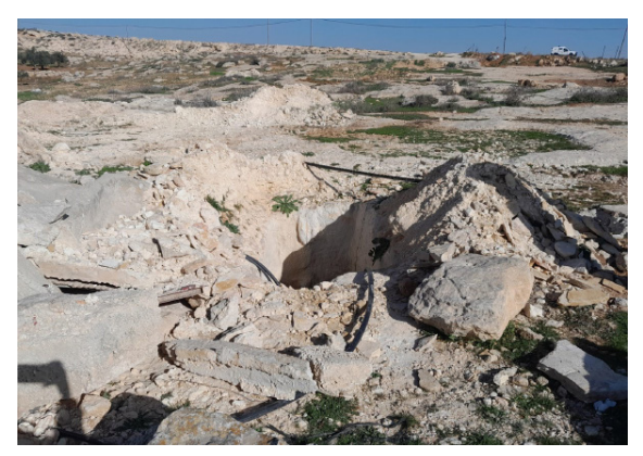
The community's water well demolished by Israeli settlers under the 'protection' of Israeli forces, according to the community.