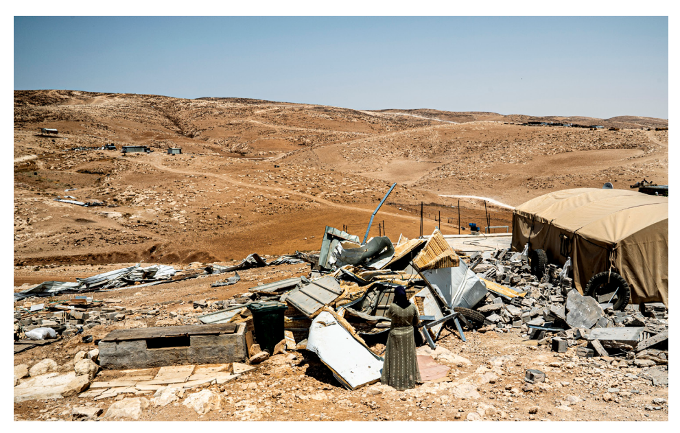
Demolished shelter in Masafer Yatta, West Bank, Occupied Palestinian Territories.

According to UN Office for the Coordination of Humanitarian Affairs (OCHA), of the injuries recorded across the West Bank since 7 October, 33% of those have been caused by live ammunition, compared with 9% in the first nine months of 2023, indicating a stark shift in tactics. <sup>26</sup> MSF patients in H2 shared stories of soldiers shooting with live ammunition at young men and houses as well. One patient reported, "they aim weapons at us immediately as we open the house door." Another patient shared, "there was a young man crossing the road, so the soldiers attacked him, and when my nephew went to defend him, the soldiers tried to shoot my nephew."