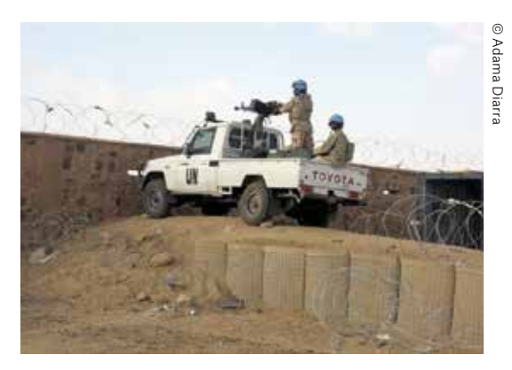
MINUSMA's blue helmets in Kidal

The military can take measures to reduce their visibility, but in doing so, they can transfer risk to the humanitarians