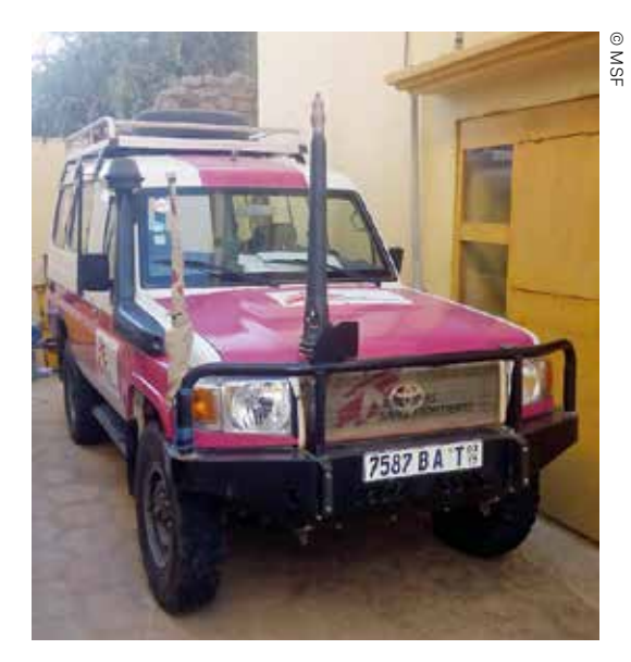
MSF vehicles in Ansongo

In MSF's view, the best way to differentiate from armed actors is to avoid collaboration