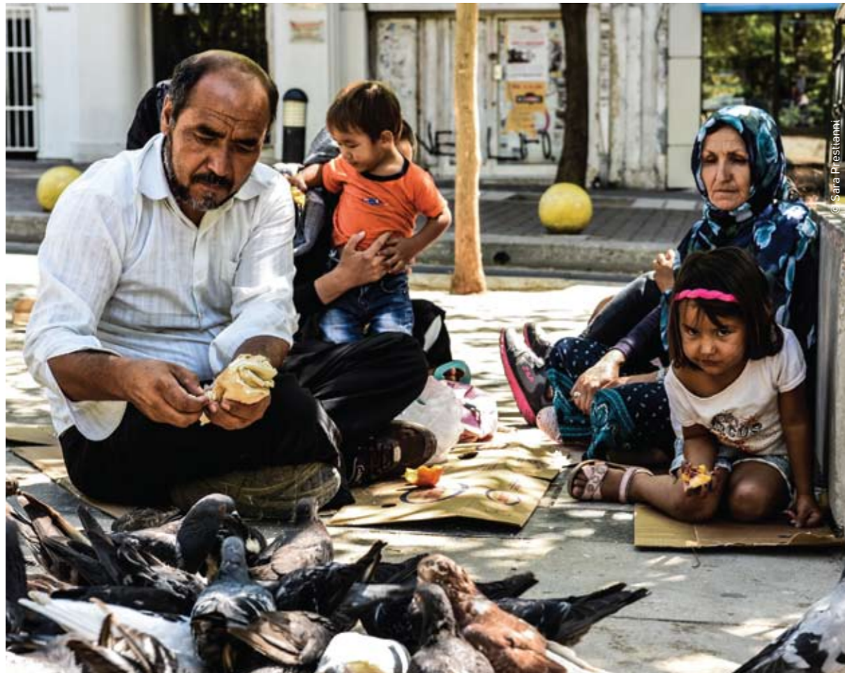
Victoria Square / August 2016

Despite hundreds of millions given to the Greek government and to international NGOs 1 , the humanitarian response remains inadequate and very slow. The lack of leadership and willingness of the Greek authorities to cooperate with other actors has a serious impact on the coordination and planning of the response. The failure to publish the final list of the camps which will remain open is one of the most blatant examples and is