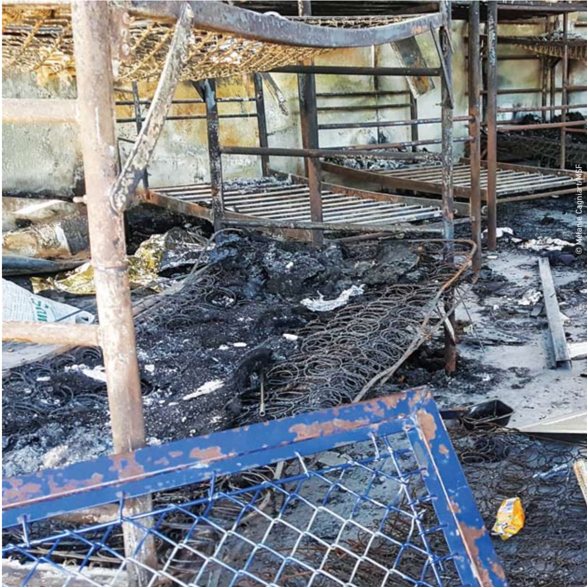
Samos / August 2016