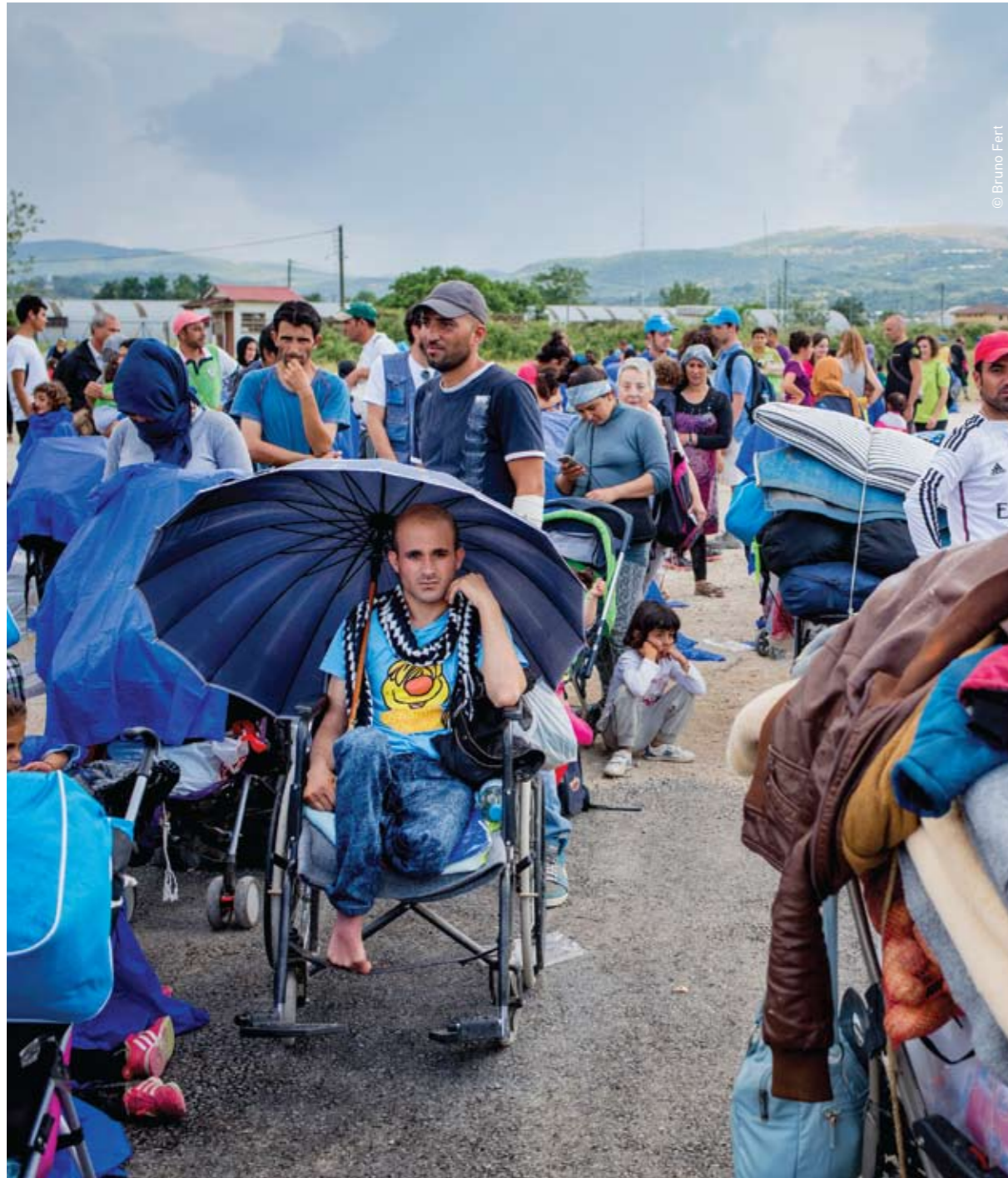
Katsikas / July 2016

uncertainty. Flashbacks and intrusive thoughts are psychological consequences of trauma and are exacerbated in conditions of insecurity and uncertainty. Inadequate living conditions and a lack of support to meet even basic needs further undermines people's efforts to re-establish a sense of normalcy and safety.