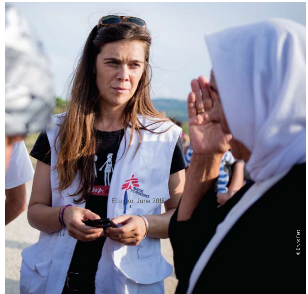
Elliniko, June 2016