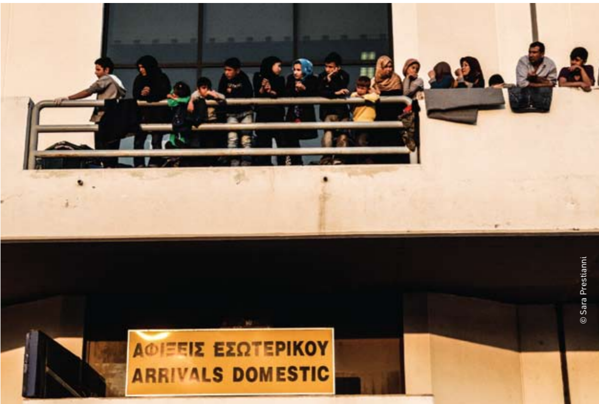
Elliniko / August 2016

Seven months after the closure of the border with FYROM, more than 50,000 people are currently stranded in Greece of which over 15,000 on the islands. As though that weren't enough, the implementation of the EU-Turkey statement at the end of March 2016 has strengthened the policy of deterrence run by the EU by putting in place an organized way to deny access to a safe environment to those having fled war-torn countries and in search of protection.