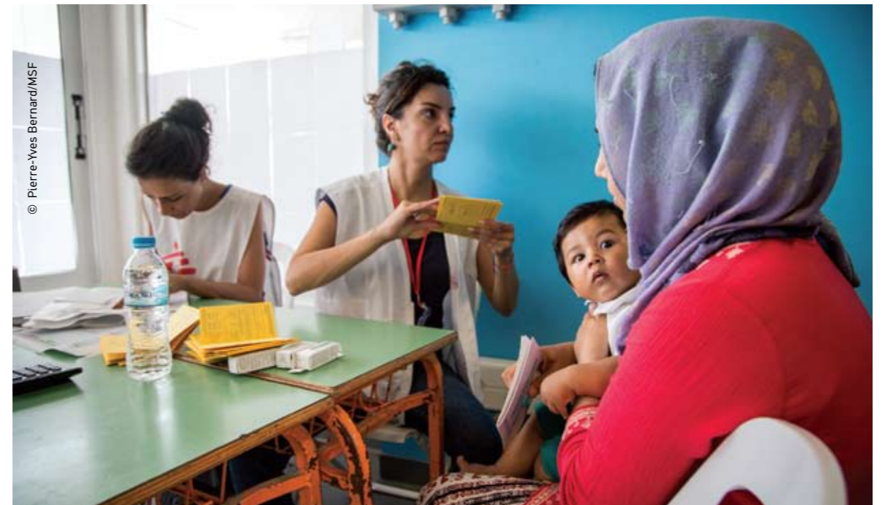
Athens / June 2016

Our teams face difficulties in concluding referrals due to the lack of accommodation. Sometimes, severe medical cases cannot be managed on the islands as there is no technical expertise available in the district hospitals. As a consequence, people are referred to Athens in order to receive appropriate treatment. But, such transfers are often delayed or even cancelled because no accommodation is available.