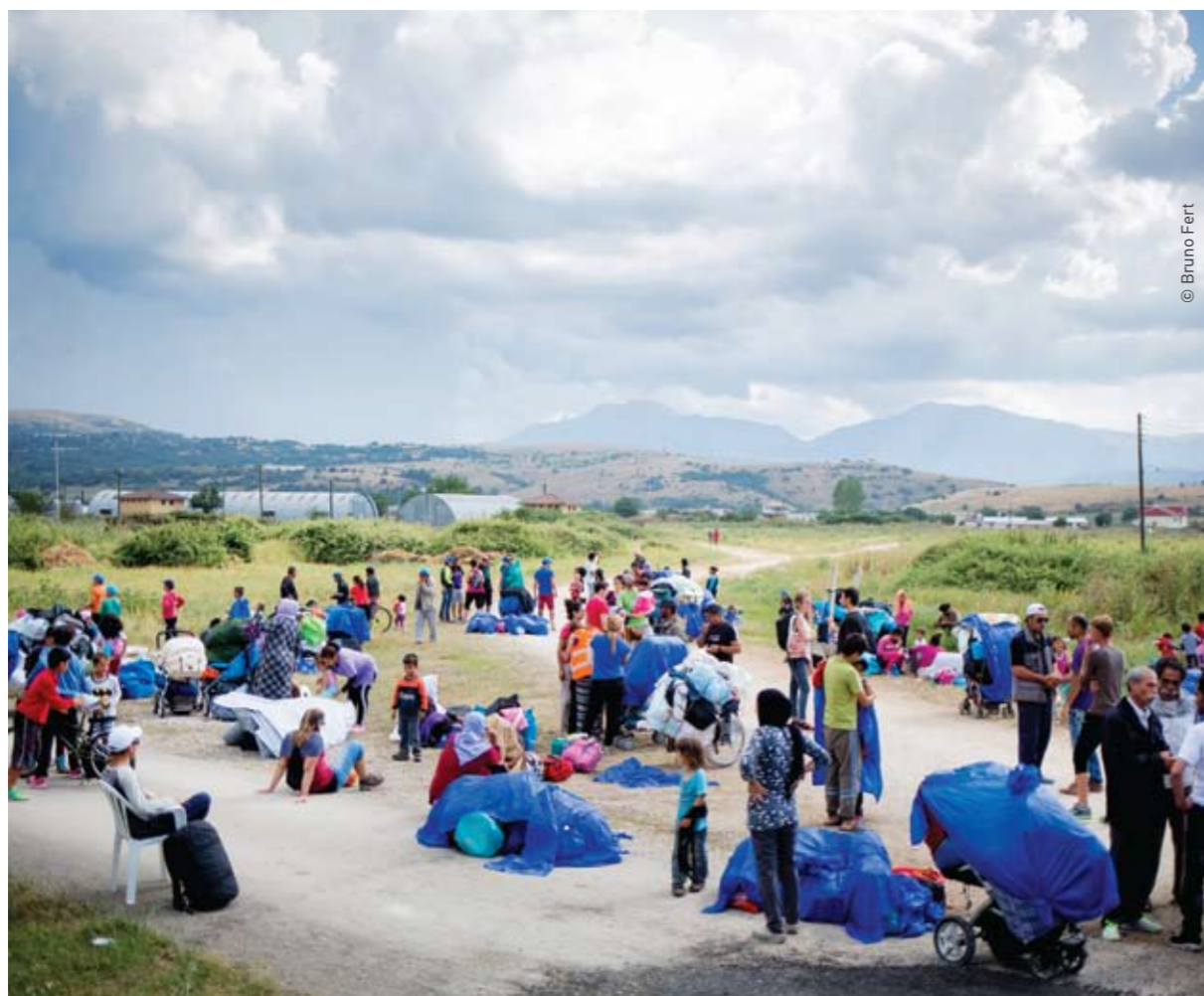
Katsikas / July 2016

While the hotspots are overcrowded, the reception conditions on the mainland where the people who arrived before the 20 March were moved are no better. The strategy of encampment should be a short-term solution, but due to the acute slowness of the system, we are currently looking at a timeframe where people will be in camps for years. Though the situation differs a lot from one camp to another, most of the asylum seekers are living in appalling conditions, which can be dangerous for their health. This is particularly true for the warehouses where people from Idomeni area were moved in May, where there are, on top of the poor living conditions, major safety concerns. Even if some improvements have been observed in the last months, the services in the camps remain sub-standard. In particular: