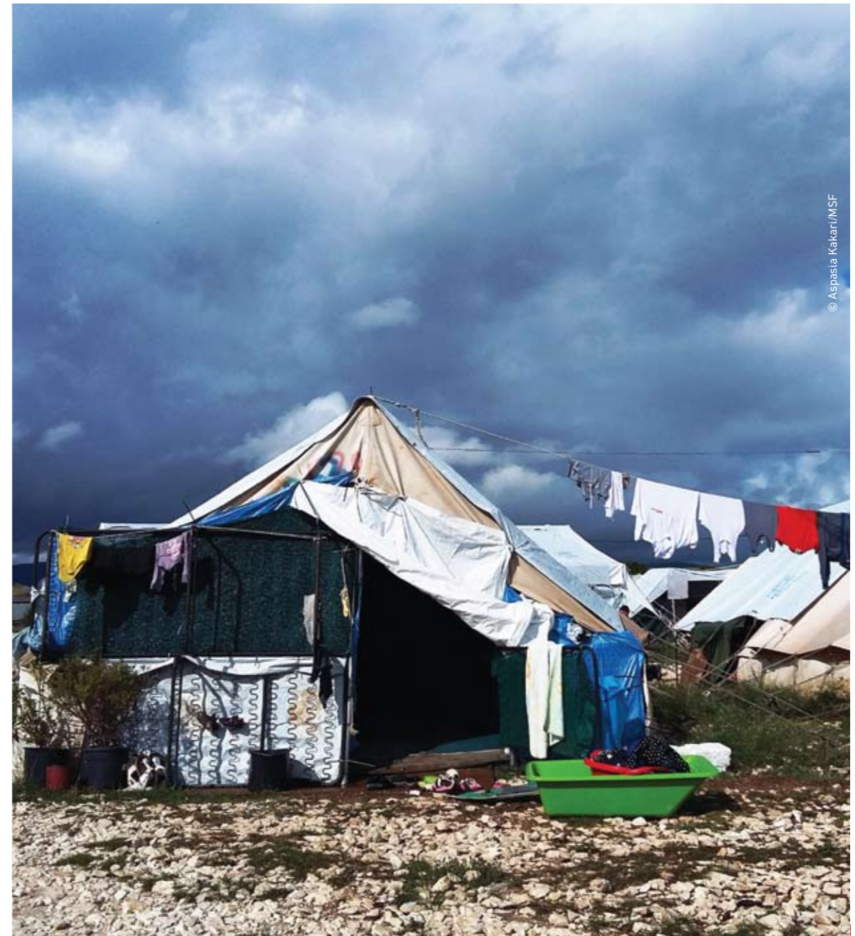
Katsikas, Epirus / September 2016