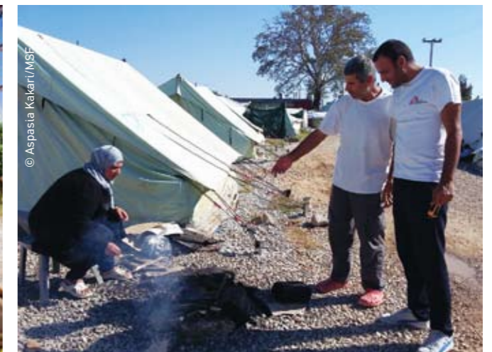
Softex, Thessaloniki / September 2016