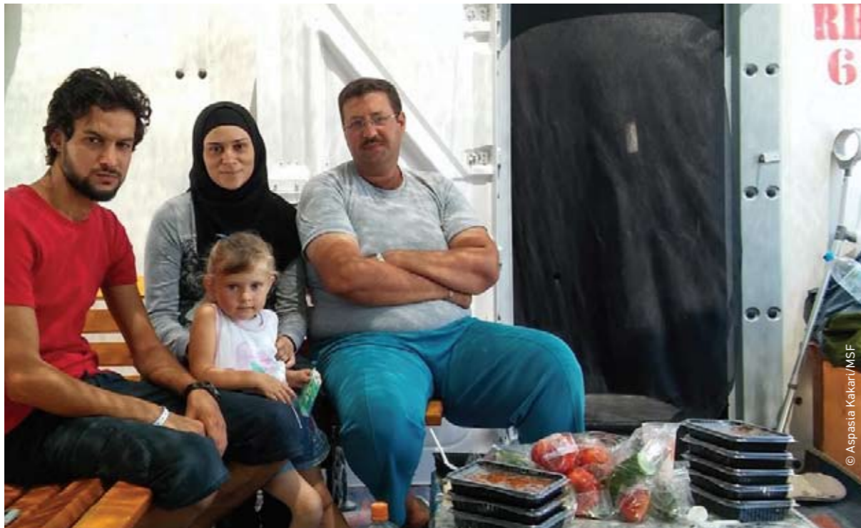
Kara Tepe, Lesvos / July 2016

*sms are expected to be sent to all the people who pre-registered for asylum. The sms will inform them on the date of their appointment to be fully registered.