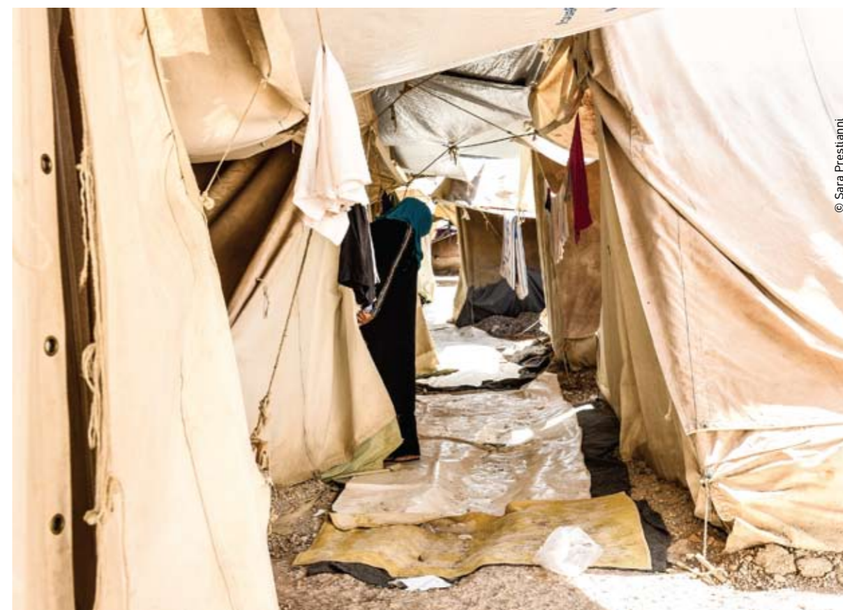
Ritsona / August 2016

People who live in tents have been exposed to heat and/or humidity during the summer (leading to soaked tents and personal belongings), insects and other animals such as snakes. Today, the winterisation of the camps has barely started and it is feared that people will not be provided with adapted shelters on time.