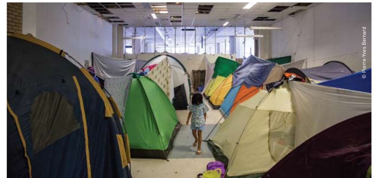
Elliniko / June 2016

On the mainland, the Greek Asylum Service (GAS), UNHCR and EASO started a pre-registration exercise on June 8th in order to overcome a backlog of pending registrations, and to identify the profiles of the people present in Greece. As of July 30th, out of 27,592 persons, 3,481 persons were identified as vulnerable as per Greek law 3 , that is 12,6% of those who were pre-registered at that time. MSF has repeatedly raised concerns that people with less visible vulnerabilities remained unidentified during the exercise. Though a 5 day training course was conducted for those participating in the pre-registration exercise; it remains difficult for un-specialised people in the course of short interviews conducted in non-private spaces to identify vulnerabilities such as victims of sexual violence, trafficking, torture or those with mental health disorders.