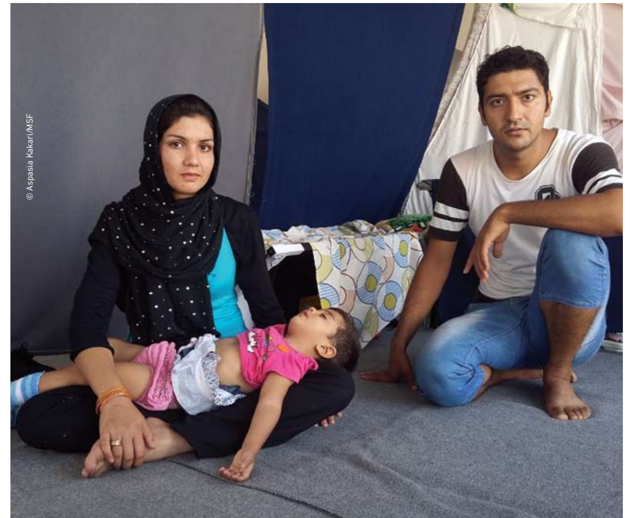
Elliniko / September 2016

The problem of access to treatment and specialised consultations for people living in the camps is exacerbated due to the lack of transportation, cultural mediators and referral pathways provided by the national health system.