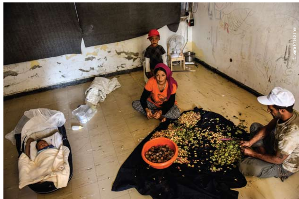
Ritsona / August 2016

Several hospitals reported to MSF their distress regarding their inability to handle the situation. Their staff are overloaded and as result very stressed; scared to make medical mistakes. There is a real willingness of the hospital staff to do their best but at the same time, there is a certain distress due to the lack of resources to cope with the situation.