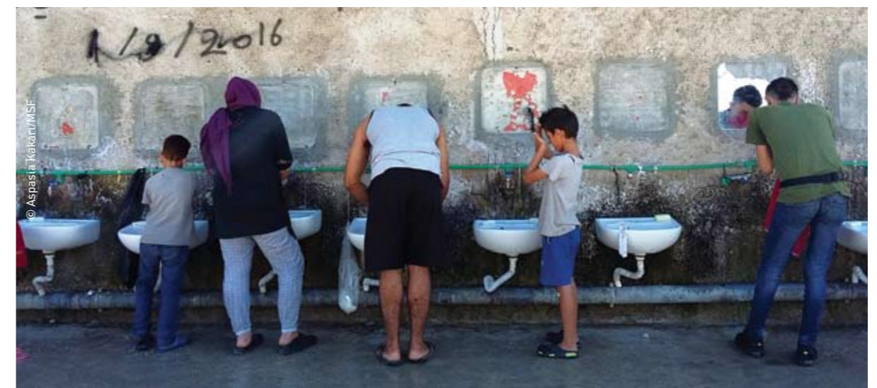
Softex, Thessaloniki / September 2016

assistance (lawyers are not always allowed to enter the hotspots although they are legally entitled to do so; appointments are announced the same day as the date of the interview which prevents the lawyers from supporting the applicants at the first stage; etc.).