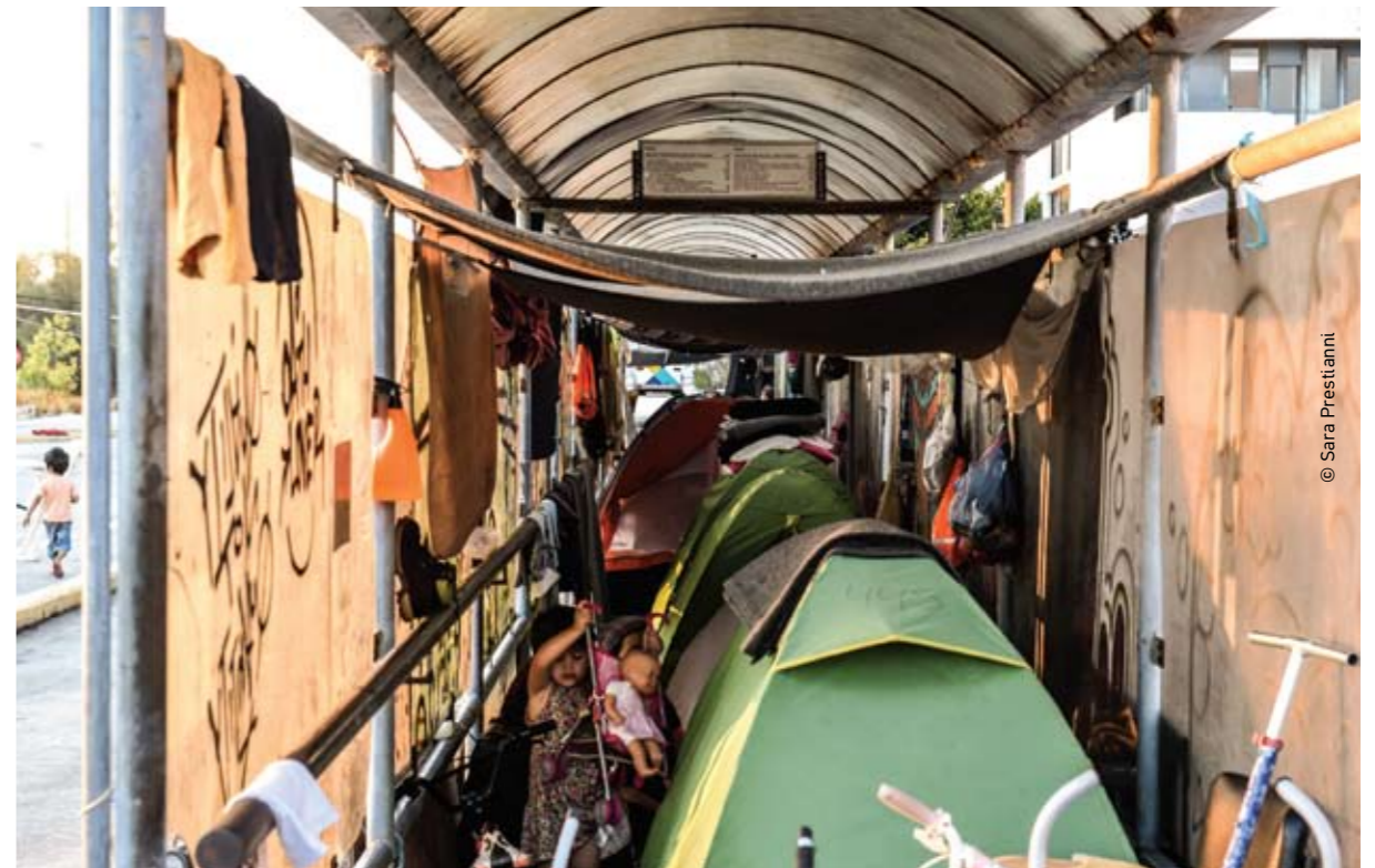
Elliniko / August 2016

Relocation should also be strengthened and speeded-up: whereas in September 2015, the European Union pledged to relocate 66,400 people from Greece, this has not been translated into practice. As of the 14th October, of the meagre 16,532 places pledged by EU Member states for relocation, only 4,716 persons have been relocated from Greece.