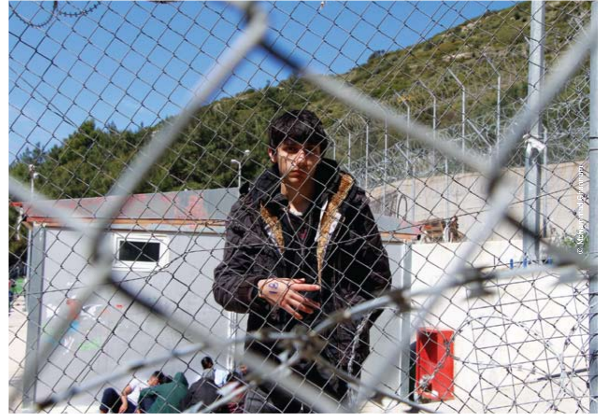
Samos / March 2016

identify people that are requesting asylum, and to identify those that can be returned to Turkey. "Accommodation" within hotspots continues to be the primary solution for people who arrive from Turkey. As a result, they are overcrowded and the alternatives are falling short to meet the needs of the new arrivals. As of 18 October, there were about 15,000 people on the islands while the capacity to house people is 7,450.