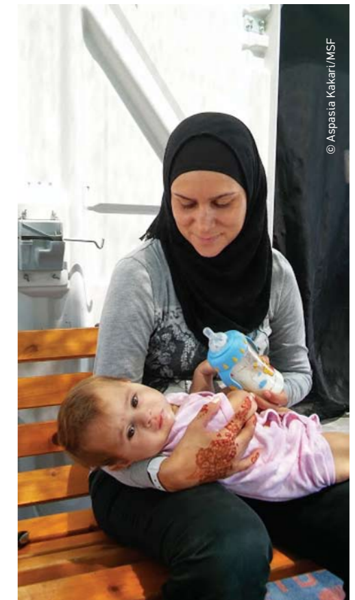
Kara Tepe, Lesbos / July 2016

In order to have access to primary health care structures (PEDY) and to have access to the scheme where healthcare costs – including costs of drugs- are subsidized, people who are pre-registered have to obtain a tax registration number and social security registration number. Though MSF welcomes the fact that the access to primary health care facilities has recently been extended to asylum seekers under the new law, we find that the administrative barriers remain in place, as people are not informed on how they should proceed and where they should go to obtain the required documents. The staff in the hospitals and health care centres are also not always aware of the new law.