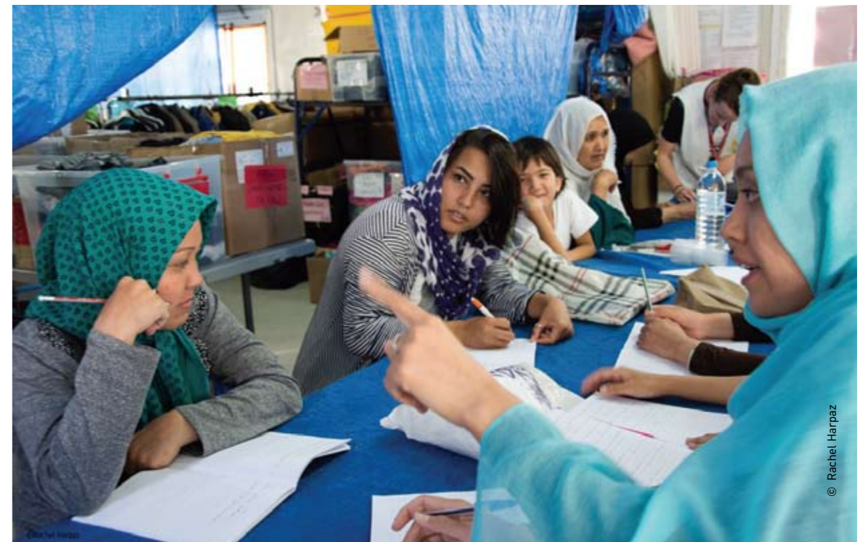
Samos / September 2016

cal interventions her role as a mother was reinforced and she rediscovered all the coping skills and strategies that were already available to her but she was not aware of. The stress gradually subsided and she is now more calm and confident, the suicidal ideation is not present anymore and she is more optimistic concerning her future and that of her family.