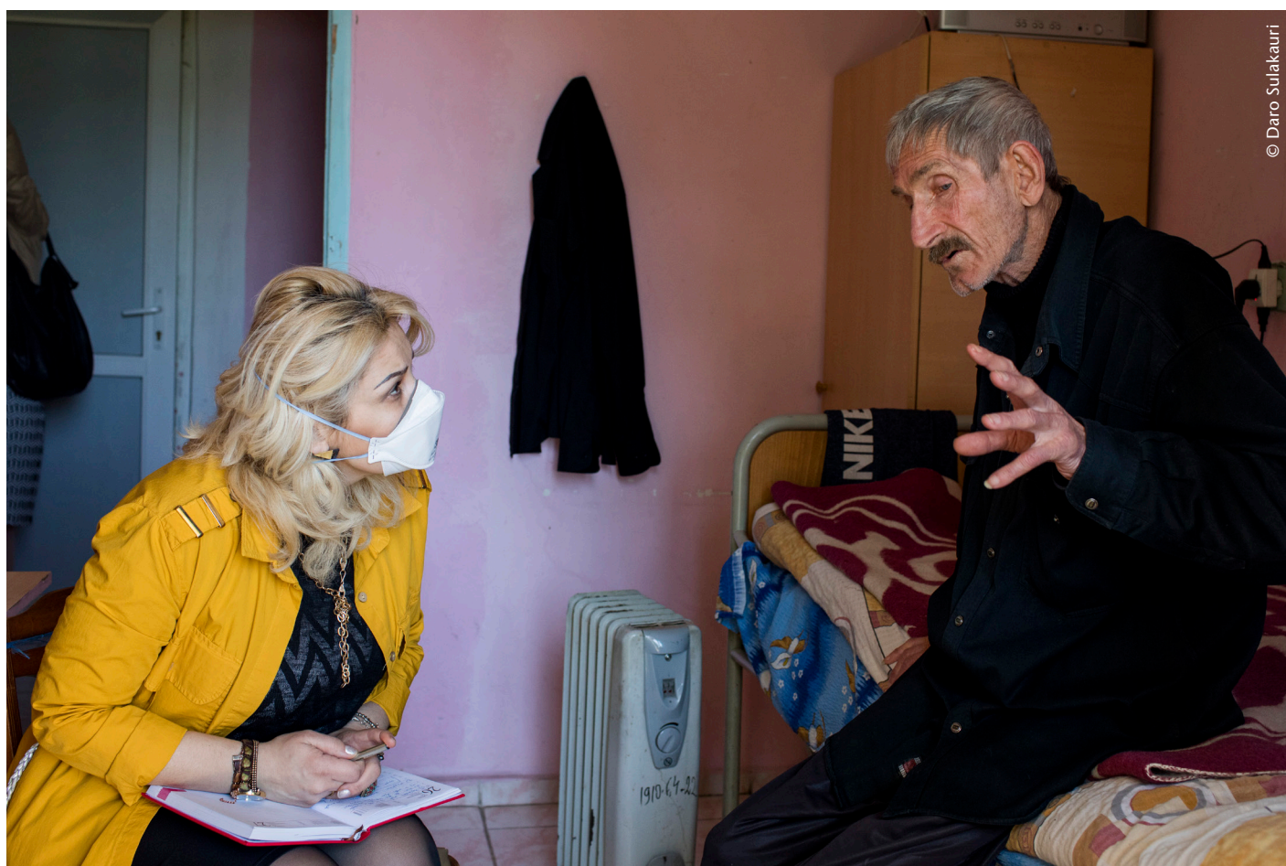
An MSF counselor consults with a patient at the Zugdidi TB Hospital in Georgia.

It is noteworthy that the two countries with the highest use of bedaquiline, South Africa and the Russian Federation, do not have access to this donation: The South African Ministry of Health does not use GDF as a supply channel; the Russian Federation does not qualify for Global Fund grants. Adding bedaquiline to already expensive MDR-TB treatment regimens significantly increases their cost. The price for a six-month course of bedaquiline is currently US$745 in South Africa and US$1,970 in the Russian Federation.