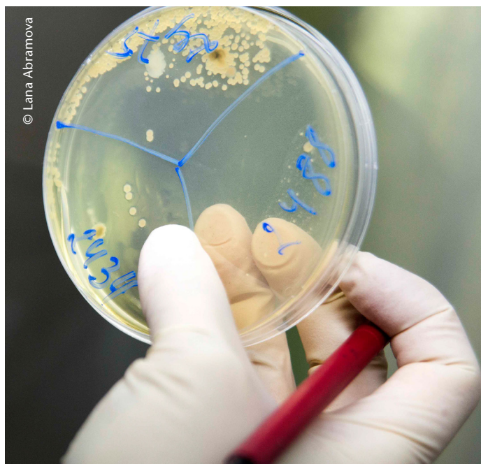
A Petri dish is examined at the Republican TB Dispensary laboratory in Chechnya, Russian Federation.